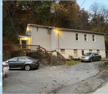
Bowlings Creek Mennonite Church, Kentucky