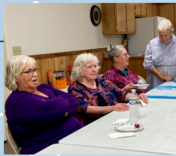
Fellowship time, Bowlings Creek Mennonite Church