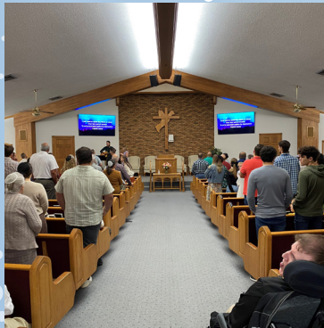
We made an Overseer visit to Bethel Mennonite, Oden Indiana