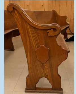
If only these benches could talk