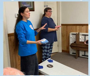
Time for some Corn Hole