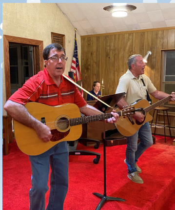
We love our Wednesday evening involvement with Operation 6:12, a drug, alcohol addiction program.