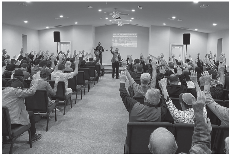
Volunteers worshiping together before the crusade.