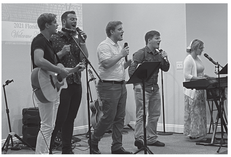
This is the singing team I was with in the North Florida Prison Crusade.

teamed up with a singing team and we would do a service for the inmates. The Holy Spirit moved powerfully in the services and many responded at the altar. It was a very special time and I believe heaven was rejoicing!