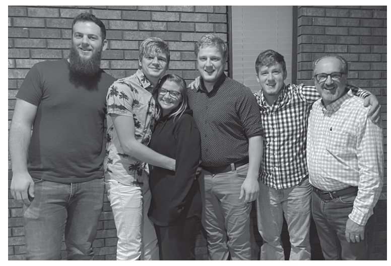
Our singing team, Higher Kingdom and yours truly.