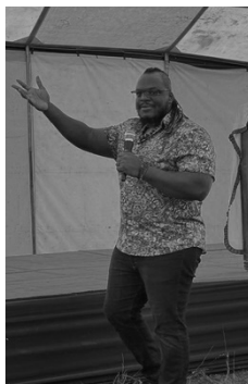
Tap preaching at the large youth rally